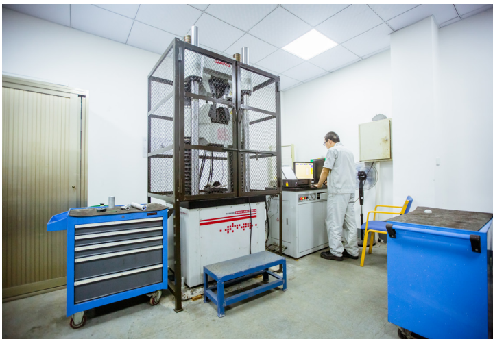
Pretec China laboratory