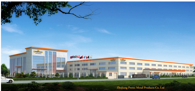
Factory in Haining, Zhejiang, China Total area: 20000m 2 . Content: mechanical production, hot dip galvanizing and powder coating

We produce two types of combination bolts - NC-Bolt (rebar bolt) and Pc-Bolt™ (tube bolt). Product data sheets and brochures for both bolt types can be downloaded from www.pretec.no .