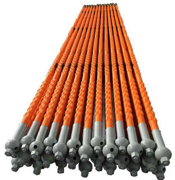
NC-Bolts packed on pallet