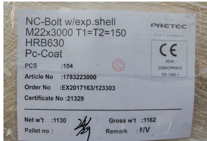
Standard label marked with certificate number

Certificates in compliance with EN 10204 3.1 are available for inspection. Approvals for bolts from the Norwegian Public Road Administration and Bane NOR (Norwegian Railway Authority) for use in Norwegian infrastructure tunnels are available on request.