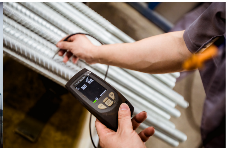
Control of coating thickness