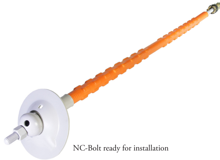
NC-Bolt ready for installation