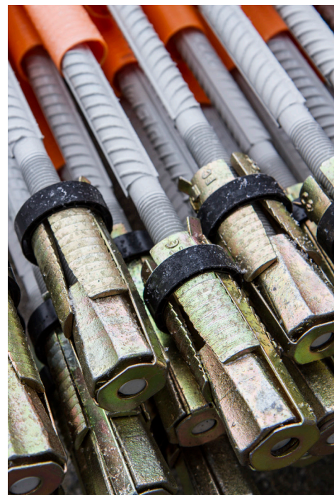
Nc-bolts with mounted expansion shells

Look under “Elements of Norwegian tunneling” and “Temporary and permanent rock bolts”.